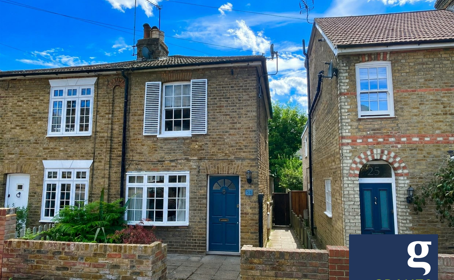
Anderson Road, Weybridge, KT13 9NL